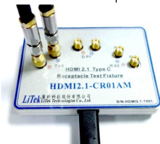
圖 2: HDMI 治具插上一條 HDMI Type C 的線材

厘科科技的 HDMI2.1-CR01AM 是一個 HDMI C 的母座測試治具。此一治具除了可以用來測試具備 HDMI C Plug 的線材外，也可以用來測試連接一條 HDMI C 的線材到 HDMI Type C 母座的裝置。在測試治具上，擁有 6 對 SMA 的高頻接頭，可以用來與示波器或訊號產生器連接。治具上的特性阻抗，經過特殊設計，可以落於 95~105 Ohms 之間，且 6 對訊號的對內時間差都被設計小於 3ps 以內。