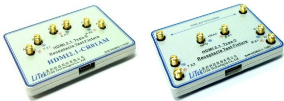
圖 1: HDMI 2.1 Type C 母座測試治具

厘科科技的 HDMI2.1-CR01AM 是一個 HDMI C 的母座測試治具。此一治具除了可以用來測試具備 HDMI C Plug 的線材外，也可以用來測試連接一條 HDMI C 的線材到 HDMI Type C 母座的裝置。在測試治具上，擁有 6 對 SMA 的高頻接頭，可以用來與示波器或訊號產生器連接。治具上的特性阻抗，經過特殊設計，可以落於 95~105 Ohms 之間，且 6 對訊號的對內時間差都被設計小於 3ps 以內。